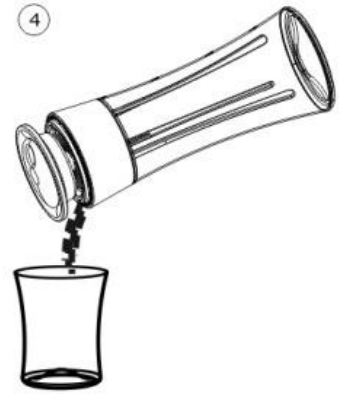
4 Turn up the lid. Ready to serve.