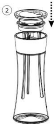
2 Put on the lid. Click into the collet; Turn to close.