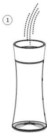
1 Pour the juice.